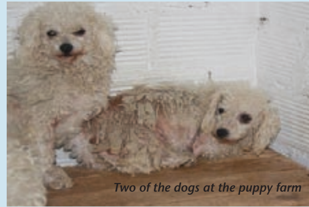
Two of the dogs at the puppy farm

condition were released and were adopted. A UK animal welfare society helped to cover all veterinary expenses." This case is a landmark and the judgment a precedent for other puppy farm owners to note!