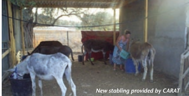
New stabling provided by CARAT

Sadly we have to report that elderly HERMES died quite suddenly last August, the vet. has said from a heart attack. He seemed fit and was not in any pain