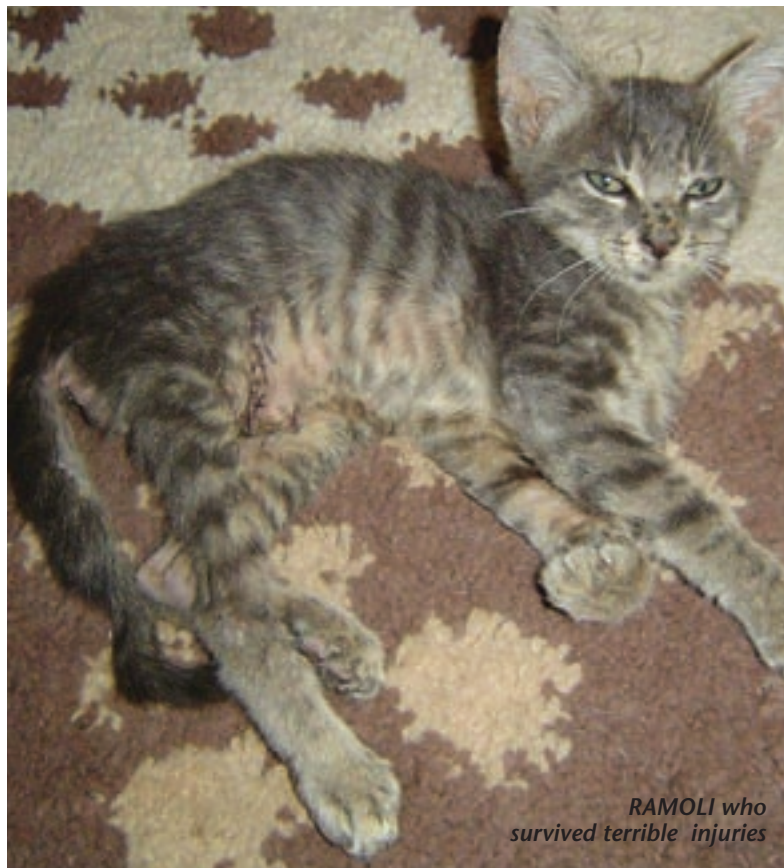
RAMOLI who survived terrible injuries

"And finally young RAMOLI (blue tabby boy) (upper right). Only two and a half months old he was caught in the engine of the car where he had hidden. A lot of injuries to his little body and the veterinarians were pessimistic about his recovery. Two big hernias in his abdomen and his back leg