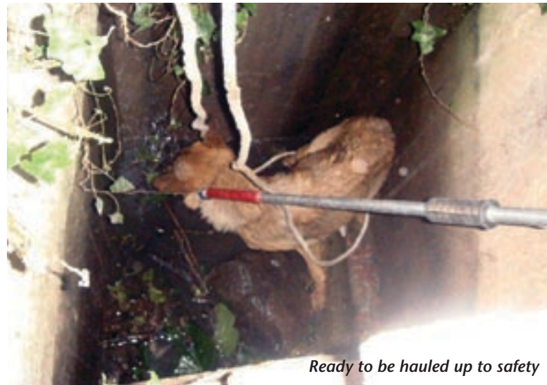
Ready to be hauled up to safety