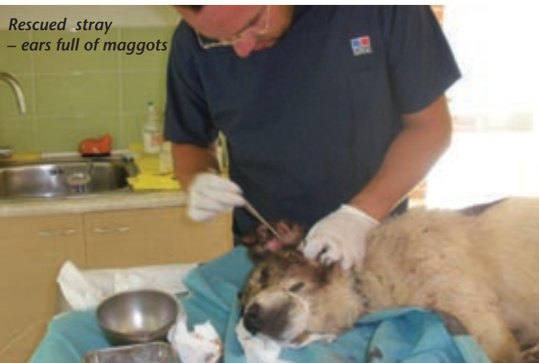
Rescued stray - ears full of maggots

for his injury, the dog was returned to his grateful and relieved owner and now lives happily with him.