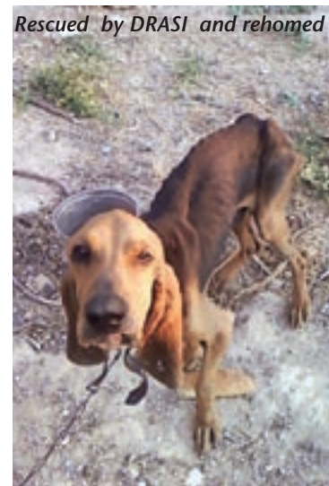
Rescued by DRASI and rehomed

This small society has wide ranging concerns...for dogs, cats, wild birds even donkeys! The immediate need is help to provide some basic equipment for the excellent new shelter which the local govt has built but which so far has only running water and no power, has one desk and chair and some worn-out dog carrying cages!. The shelter can hold up to 80 dogs at any one time but as the clinic is not equipped, the dogs have to be ferried to and from the vet ...some distance away. We are replacing the broken carrying cages and sourcing a supplier for dog beds and other immediately needed equipment.