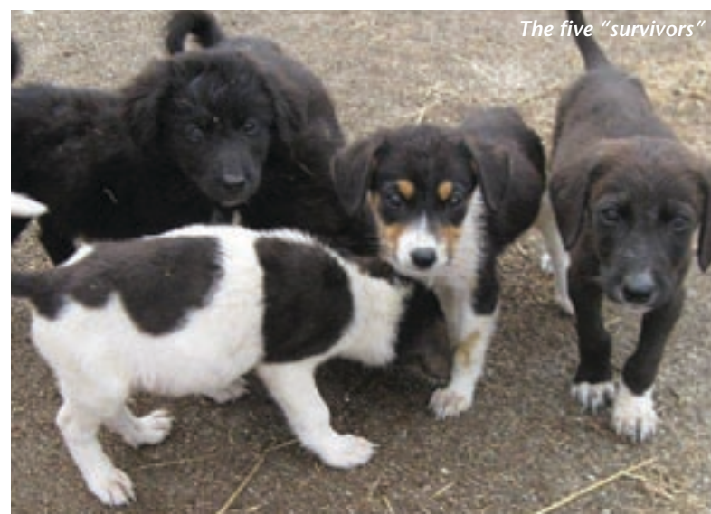
The five "survivors"

And finally ..... "Early September I received a call about 8 puppies found abandoned in a box in the mountains. Unfortunately I couldn't help due to lack of space at the shelter so told the people they would have to wait. A few days later these 8 puppies were found abandoned near a dried river bed in Fourka village. I provided food and water but no shelter...it was heartbreaking to leave them. Then all but one disappeared. Another one was found dead nearby and I feared the worst for the other 6. Two weeks later while driving home I witnessed a puppy being hit by a car. Then another puppy ran to sit by his side as he screamed in pain. I thought he would die in my arms; I rushed them home (no vets on Saturday) and gave him first aid. Miraculously he survived his ordeal and on Monday xrays revealed that he had a broken nose, hence the name COOPER (Henry)! Another 2 weeks passed and I received a call about 3 more puppies abandoned in another village. Yes, the same litter, and these were infected with gastro-enteritis. TRIxie the sibling who had sat by COOPER's side when he was injured sadly was too weak to recover. COOPER spent one week at the vets on the drip but showed everyone that he was a fighter and survived, and the others ARIEL, WINSTON, FENYA and TOBY (below) also survived. They all deserve medals in the shape of new loving homes."