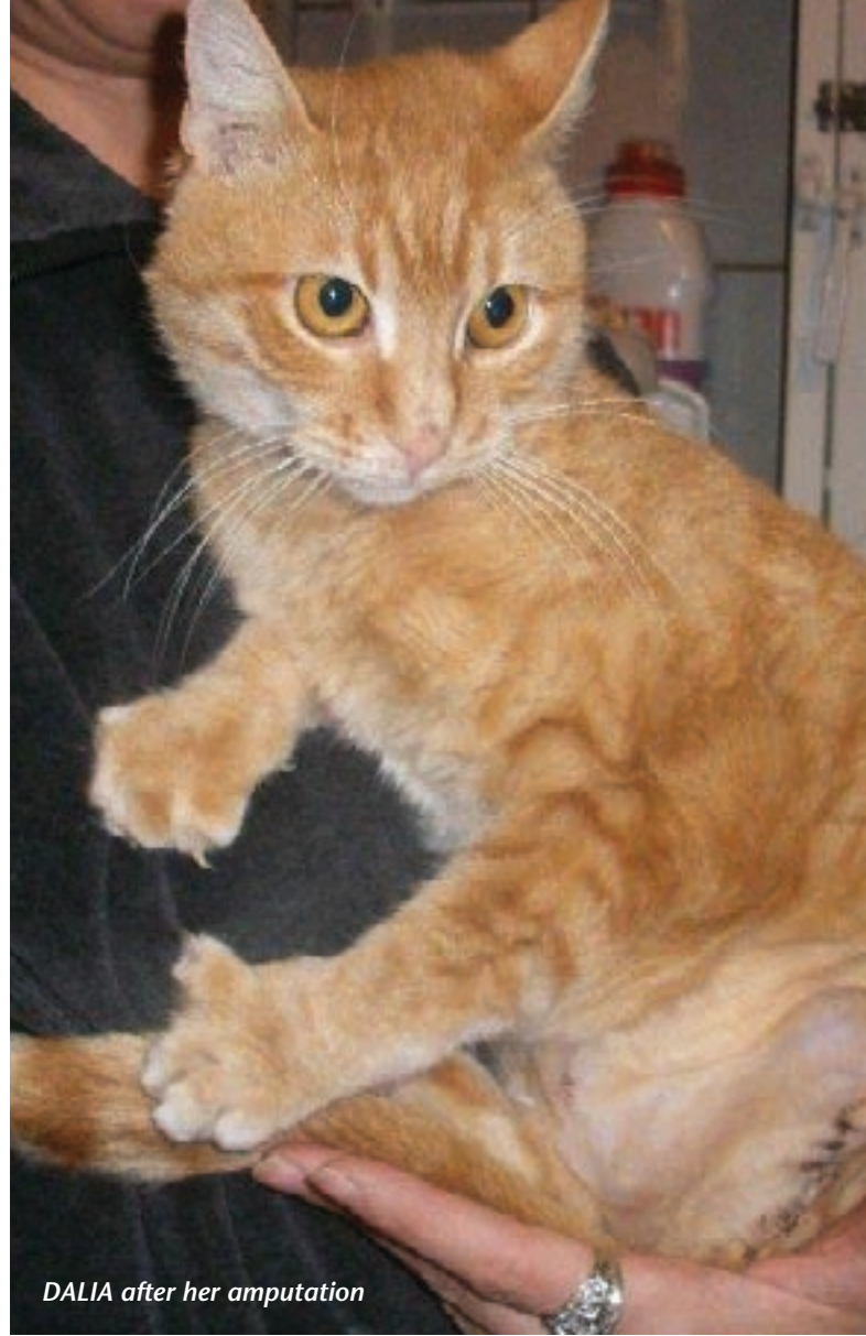
DALIA after her amputation

"A shocking sight at the last programme: A male Persian cat was brought with a metal rod sticking out of the leg! Said to be a stray, he was in fact owned by a woman in her building with four other Persians. Her apartment was so smelly that she was reported and told to abandon the cats