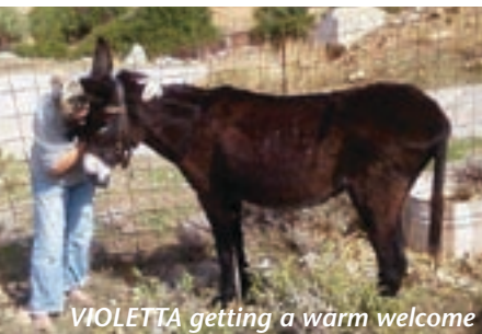
VIOLETTA getting a warm welcome

Dutch and UK equine teams have provided invaluable help ..with farriers and equine dentists. Owners at first suspicious of a "free" service, now fully appreciate its value.