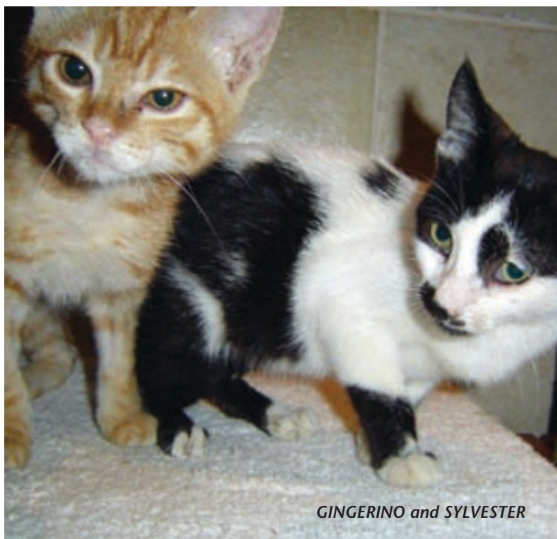
GINGERINO and SYLVESTER

"A really hard case was the one I was faced with a few months ago..a colony of 70 adult cats and over 30 kittens, most of which were infected with herpes virus. The adults were neutered and the babies were treated with antibiotics and eye drops..And some of them were given for adoption."